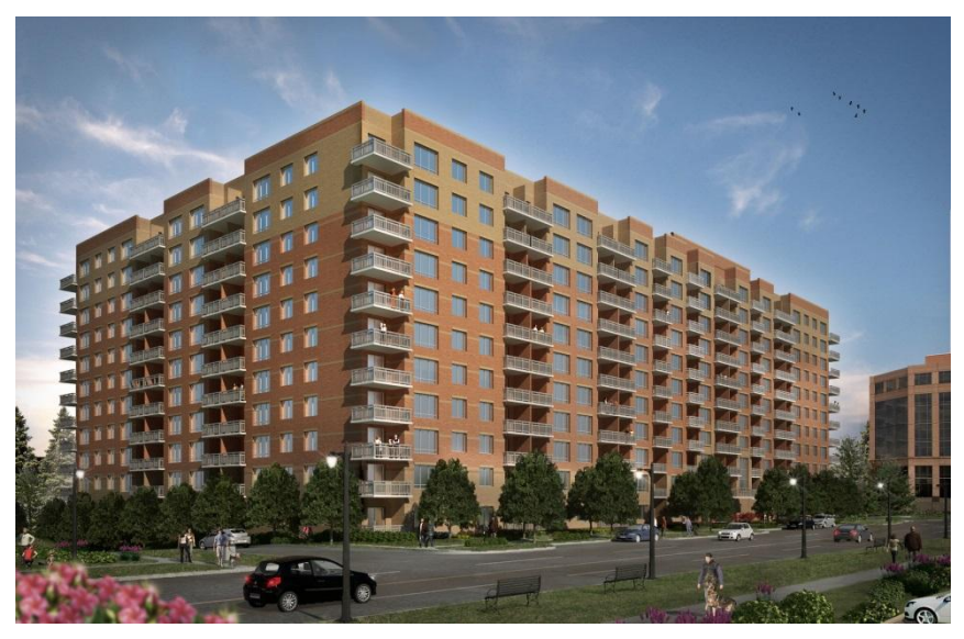
Figure 2 – Square 1400

The apartment structure is comprised of a cast-in-place frame with a brick façade exterior. The nearby parking structure utilizes a precast structure with a precast exterior skin to match the neighboring apartment building. Site work includes the demolition of the existing former HITT Contracting Headquarters.