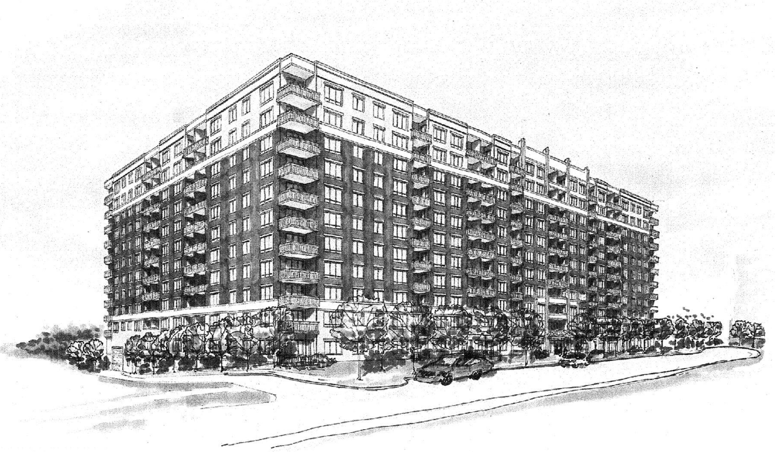
Figure 1: Sketch of Square 1400